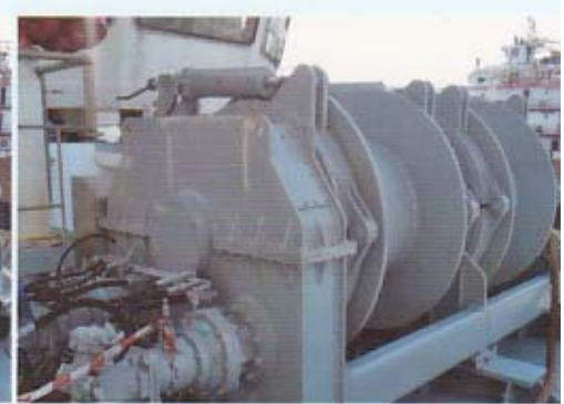
Container & Cargo Handling Equipment