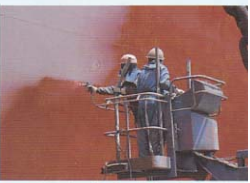
Marine Paint Solution